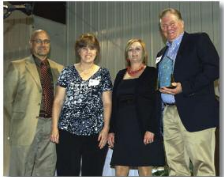
Braum's Business of the Year